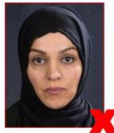
Background too dark