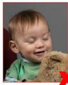
Eyes not open/toy visible