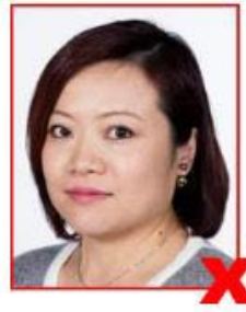
Side on to camera